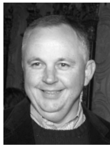
Dick Cook, Disney

Defenders of artistic freedom? These studio bosses let Big Tobacco promote smoking to global audiences in theaters, over satellite and cable, on tapes and DVDs, and so cleverly that you can’t tell it apart from paid product placement.