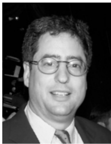
Tom Rothman, 20th Century Fox