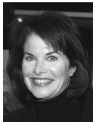
Sherry Lansing, Paramount