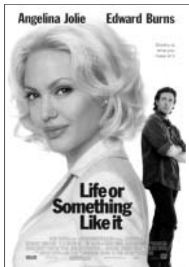
IN ABOUT A BOY , rated PG13, filmdom's cutest cad chain-smokes around a 12-year-old boy he's mentoring. Another recent PG13, Life or Something Like It , paired Angelina Jolie with Camels. Hollywood began to introduce smoking into more kid-rated movies after Congress pressed the industry to keep more teens out of movies rated R...

Only two industries in America act as if pushing poison to kids is a legitimate business.